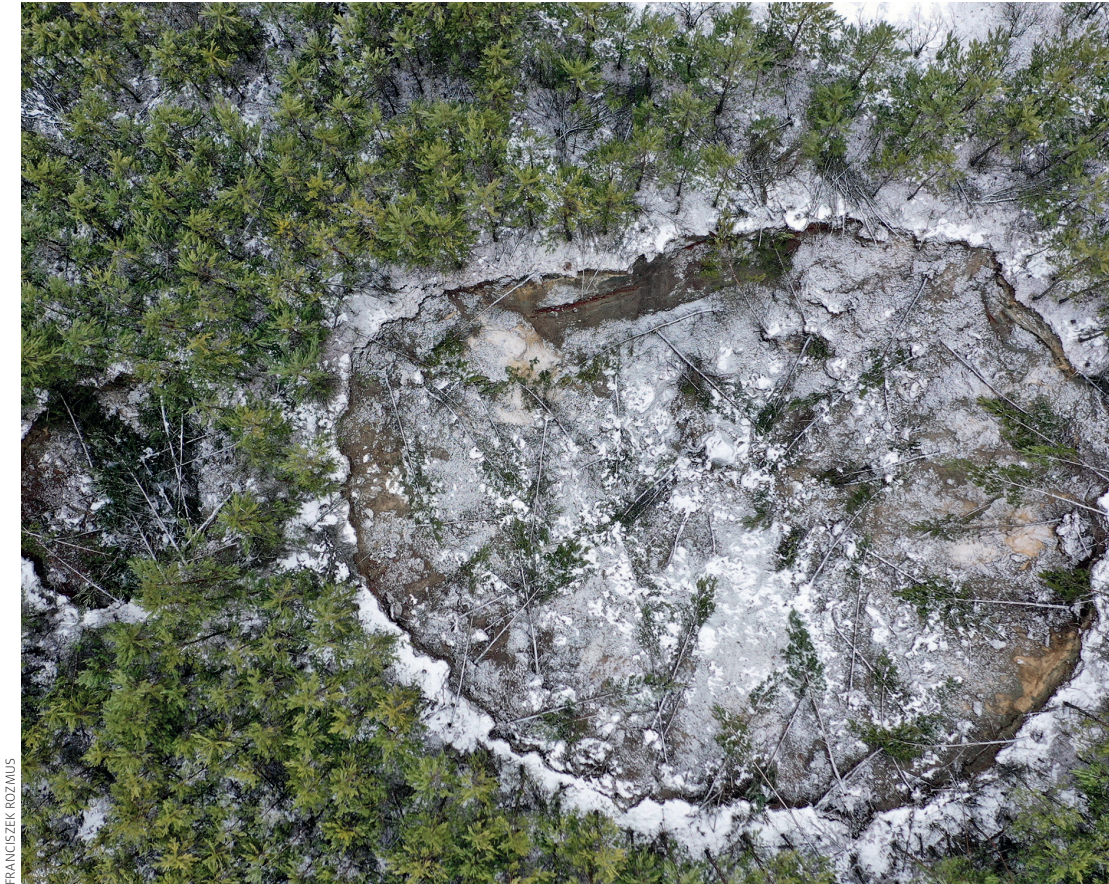
Post-mining sinkholes in the Olkusz area