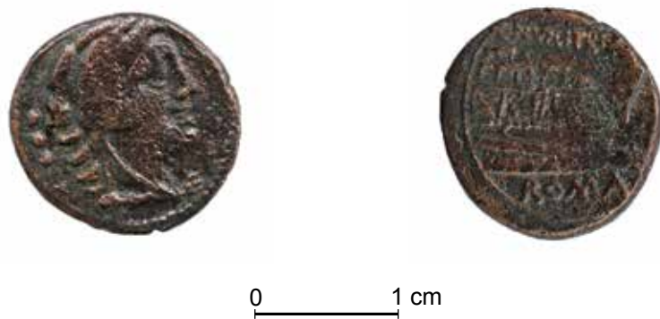
Fig. 2. Selected Roman Republican bronze coins recorded in Poland; Photo by H. Górecki (Museum in Jarosław, The Orsetti House).

1 — Węgiełka, powiat Jarosław, województwo podkarpackie, Poland. Roman coin: Republic, semuncia, 217–215 BC, Rome; 2 — Wola Buchowska, powiat Jarosław, województwo podkarpackie, Poland. Roman coin: Republic (C. Numitorius), quadrans, 133 BC, Rome.