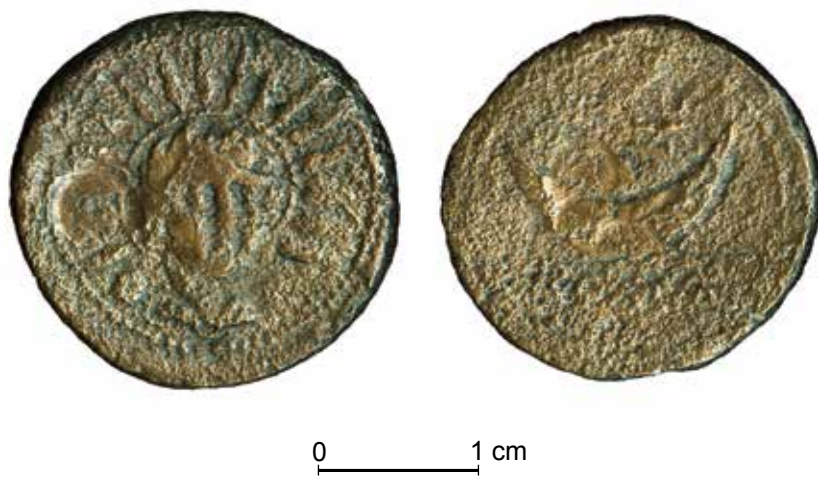
Fig. 3. Selected Roman Republican bronze coins recorded in Poland.

1 — Zbylitowska Góra, powiat Tarnów, województwo podkarpackie, Poland. Roman coin: Republic, as, after 211 BC, Rome; Photo by R. Moździerz (Regional Museum in Tarnów); 2 — Szczecin-Golecino, the capital city of w. zachodniopomorskie, Poland. Roman coin: Republic, uncia, 217–215 BC, Rome; Photo by G. Soleccki (National Museum in Szczecin).