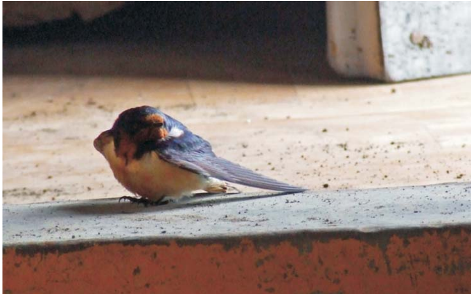
Fig. 2. Barn swallow Hirundo rustica observed at a laboratory building at Arctowski Station, King George Island, South Shetlands, on 13 November 2006.

Couve and Vidal (2003) reported the occurrence of ship-assisted barn swallow transported to the South Shetland Islands but without any supporting details. These observations, along with an at-sea record of austral negrito ( Lessonia rufa ) and two “ship-assisted” barn swallows reported from near Adelaide Island in November 1993 (Shirihai 2008) represent the southernmost sighting of passerine birds anywhere in the world.