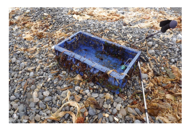
Fig. 3. Fishing box with overgrowth ( Mytilus sp., Lepas anatifera, Eucratea loricata , Gastropoda eggs, Semibalanus balanoides and Ectocarpales), beach between E and F transects.

Macro-plastic, a vector for species dispersal