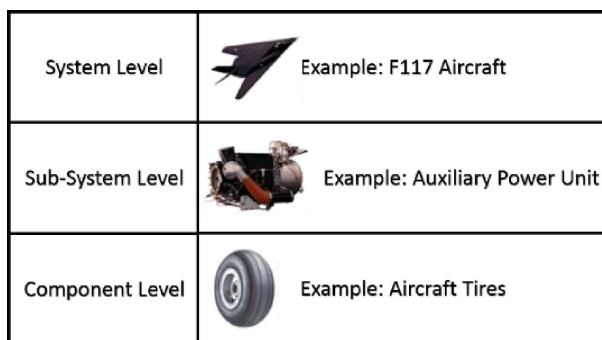
Fig. 2. Different levels of PBL contract [23, 24].

PBL can be made in many different levels. Picture two is showing three examples of that. PBL can contain system level at the widest. At this point were talking about the whole aircraft as a unit. Subsystem level comprises of a group of smaller systems, such as a motor, that finally compile a complete system, an aircraft. Smaller PBL contracts can be built on component level. This includes single components, component families or spare parts for different maintenance programs. Case organizations in this study are building their PBL capabilities at component level and sub-system level. It can be said that system level PBL requires a lot of extensive and time-consuming learning and development before actual PBL contract can be established.