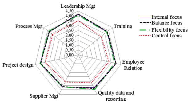
Fig. 2. TQM practice comparison between the four clusters.

One-way ANOVA was then performed to evaluate the differences in terms of TQM practices between the four clusters (Table 2). The results showed that the significant values of all seven TQM practices, ranging from 0.000 to 0.012 are smaller than 0.05. This implies that there is a significant difference between the mean scores on each dependent variable across the four clusters [37]. The comparison can be further illustrated in Fig. 2.