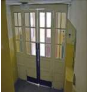
Fig. 6 Paneled wall and double swing doors, Cracow, 2014; source: M. J. Łukacz,