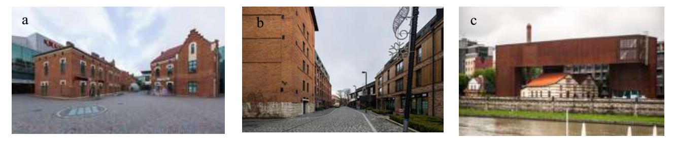
Fig. 1 a) Shopping mall in the former City Slaughterhouse; b) New and historic restored buildings of Lubicz Brewery performing residential and service functions; c) Cricoteka - T. Kantor Art Documentation Centre with buildings and chimney of the old Podgórze Power Plant; Source: [12]

Construction works on buildings included in the revitalisation program are a special type of construction project in which, in particular in the execution phase, there are many difficult technical situations which constitute a source of risk. For these reasons, as well as due to special legal conditions - especially concerning historic buildings and works connected with the preparation of renovation works (until their commencement), they require great care and knowledge of regulations, as well as their good design and planning. Due to the growing scope of construction projects for various purposes in the areas covered by revitalisation programs, the knowledge based on experience is needed in order to identify sources and risk factors, which is necessary for the successful completion of a construction project.