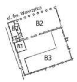
Fig. 3 Ground floor layout of the former power plant complex, [13]

The St. Wawrzyńca Quarter Revitalization Program provided for preservation of many historical elements for the investment. It was decided to keep the entire administration building and the adjacent front wall of the former turbine hall B2 from Wawrzyńca Street (Fig. 4). Manual demolition of masonry walls of power plant buildings was carried out, so that after cleaning and preparation of bricks, they could be used again in the new buildings (Fig. 5). Similarly, a part of the power plant's interior furnishings were used, i.e. a part of window and door joinery (Fig. 6), a stone panel, a steel balustrade and a commemorative plaque of the manufacturer [12].