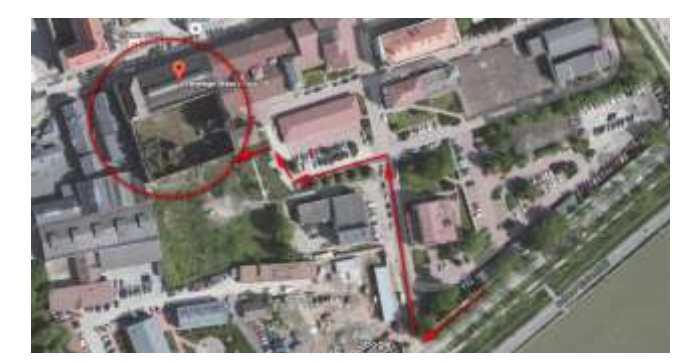
Fig. 9 Location of the investment with marked access for technological transport, may 2014

A technological and organizational challenge during the beginning of works was also the location of the crane, the range of which will allow to serve the entire construction site. For this purpose, it was decided to use a 46-metre-high crane, under which a special reinforced foundation in the construction of slab was made (it was taken into account at the design stage). Reinforcement of the foundation slab was done in two directions, crosswise, two levels. Spacers were used between the top and bottom chords to stiffen the slab structure during the concreting process. Due to its size, the foundation slab was divided into smaller plots and made in stages, and additionally the contractor assigned one of the plots for a temporary storage yard.