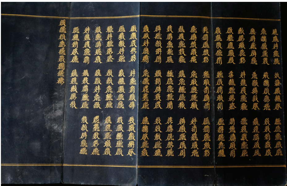
Fig. 6 and Fig. 7. The Saddharmapuṇḍarīka Sūtra in the Tangut language, fragment