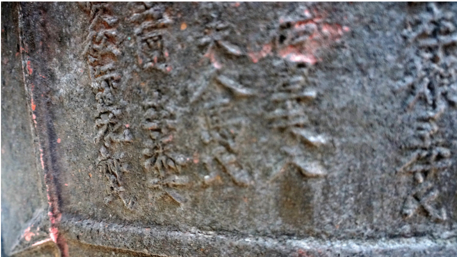
Fig. 3 and Fig. 4. A bell inscription bearing the name of Haoshi 郝氏, who was a Concubine of the Shenzong Emperor 明神宗 (r. 1573–1620), Xiangjie Temple 香界寺, the Western Hills Park, Beijing 北京西山八大處