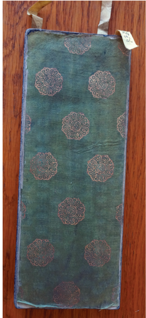
Fig. 5. Cover of the Saddharmapuṇḍarīka Sūtra in the Tangut language

The Tanguts were considered Semu 色目 under the Yuan class system, thus separating them from the Northern Chinese. They enjoyed a status and privilege superior to those accorded to either the Jurchens or the Khitans, let alone the Chinese. Central China (Hobei and Anhui) harbored small communities of Tanguts who evidently continued to use their script until the end