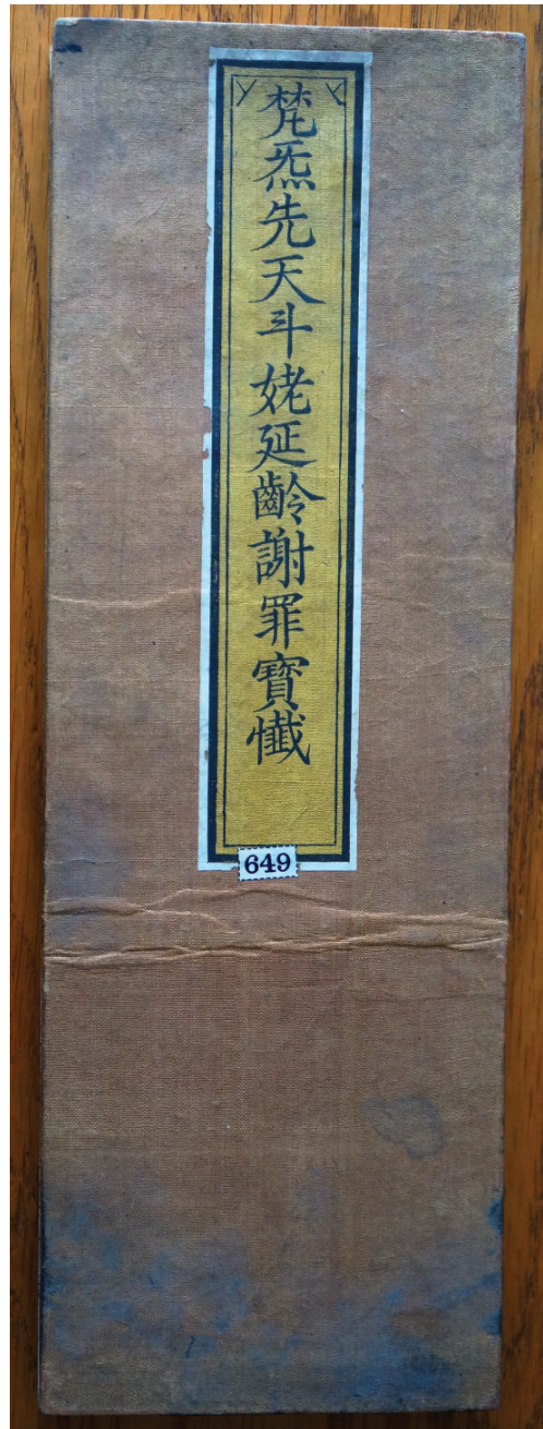
Fig. 1. (649) Fan qi xiantian doumu yanling xiezui bao chan

From the titles above, one can see that most of those scriptures are quite common. However, one scripture that is unique is a blockprint No. 649 entitled Fan qi xiantian doumu yanling xiezui bao chan 梵炁先天鬥姥延齡謝罪寶懺. It is not collected neither in the Buddhist nor Daoist Canon. It contains the colophon of the wife of Nalan Mingzhu 納蘭明珠 (1635–1708). 16 According to