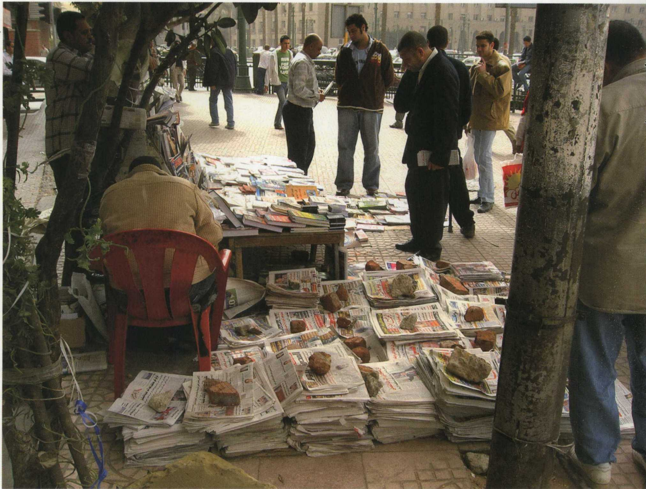
Newspaper salesmen on a Cairo street

surveyed in the Middle East were opposed to it. While most respondents view Saddam Hussein's ouster as something positive, the very same people are nevertheless opposed to the US and its allies maintaining a lasting presence in Iraq. They believe the West to have motives other than just fostering democracy in Iraq. These ulterior objectives are considered to be a desire to control Arab oil resources, to create a protective umbrella for Israel, and to strive to dominate the Islamic world. In this sense the intervention of 2003 is perceived as indicative of a new colonialism, as another link in the chain of events including the Suez Canal crisis of 1956, the Six-Day War of 1967, and the Soviet intervention in Afghanistan in 1979. In this respect, a considerable portion of the region's inhabitants sympathize with Al-Qa'ida's struggle against the West, although only 6–7% of those surveyed support terrorism.