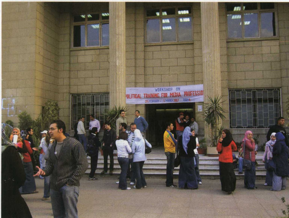
Students outside the Faculty of Economics, Cairo University

What future lies ahead for these mutual relations, of such import for the world at large? There are several issues that contribute to the overall picture, one of them being theology.