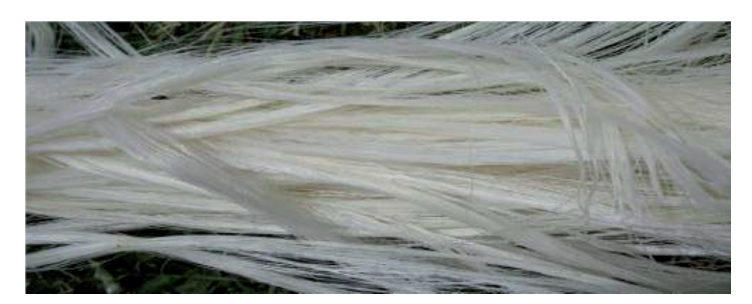
Fig. 4. Sisal fiber [33]