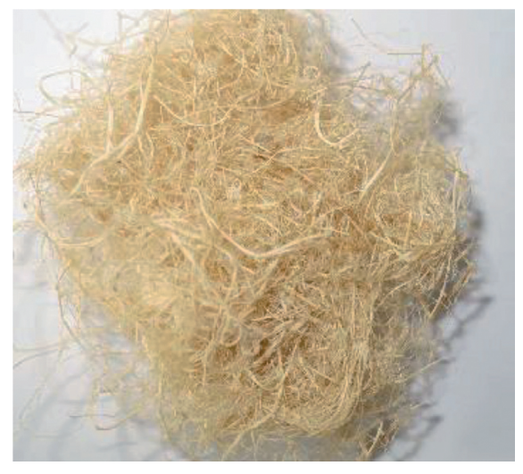
Fig. 2. Microscopic bamboo fiber [62]

Research by [62] investigate the mechanical properties of asphalt binders and mixtures under a range of loading and temperature conditions. Performance tests showed that adding bamboo fiber to asphalt mixtures enhanced their stiffness and cracking performance at an intermediate temperature, but these benefits diminished at higher temperatures. The photo of the bamboo fiber is shown in Fig. 2.