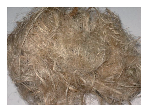
Fig. 5. Jute fiber