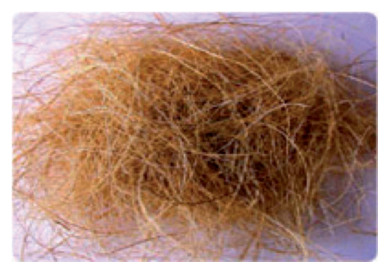
Fig. 7. The appearance of coconut fiber [6]

Research [6] investigated the engineering properties of stone mastic asphalt containing coconut fiber. Various SMA mixtures were tested for their drain-down characteristics, static and repeated indirect tensile strength parameters, moisture susceptibility characteristics (tensile strength ratio), and retained stability. The Marshall properties of SMA mixes can be improved by only 0.3% coconut fiber. When fiber is included, SMA mixes benefit from improved drain-down, indirect tensile strength, and fatigue properties.