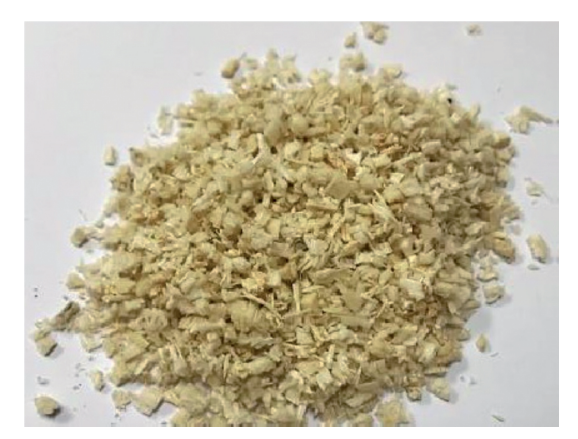
Fig. 8. Sugarcane Bagasse Fiber [89]

Bagasse is a fibrillar component of many naturally occurring composites (wood, sugarcane straw, and bagasse) composed primarily of cellulose, glucose–polymer with a high modulus. After crushing and extracting sugarcane juice, a fibrous residue of cane stalks is left behind, increasing waste material [88]. To solve this issue, recycled sugarcane bagasse is used to decrease agricultural waste and yield low-cost SMA pavement that is both durable and reduces drainage issues. See Fig. 8 [89].