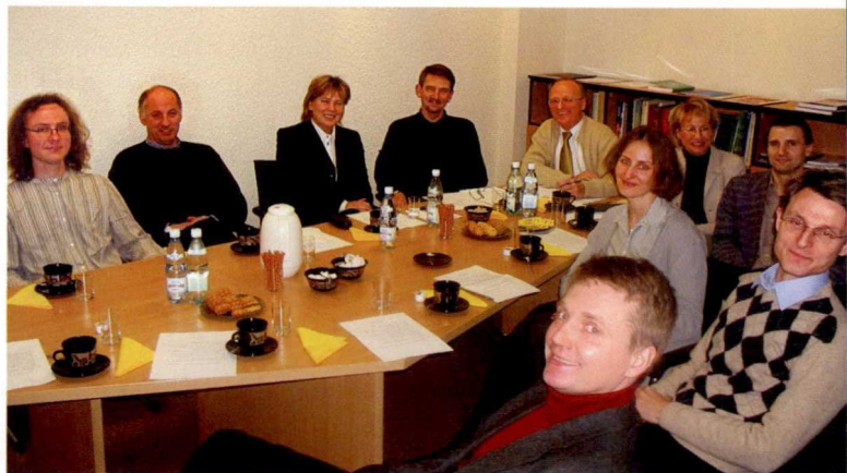
Young and energetic lab leaders are the driving force of the Institute

The results obtained by Institute's researchers have been published in such prestigious journals as J Biologi-