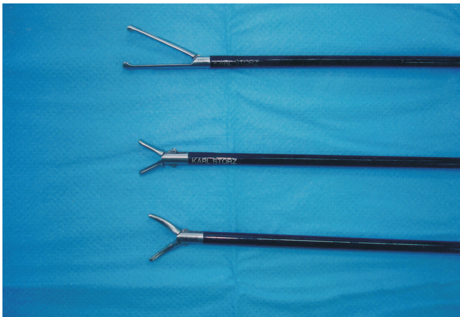
Fig. 2. Laparoscopic graspers. From the top to bottom: Babcock forceps, Reddic-Olsen forceps, Kelly forceps.

a blade for puncturing tissues of the abdominal integument and a cover (a tube) for introducing the laparoscope and laparoscopic tools. The blade may be ended conically or pyramidally, which is more advisable for such cutting edges that make penetration of the abdominal cavity walls much easier (Howard et al. 1992). Most trocars are equipped with a Luer lock extension that enables constant insufflation of gas into the abdominal cavity excluding the Veress needle.