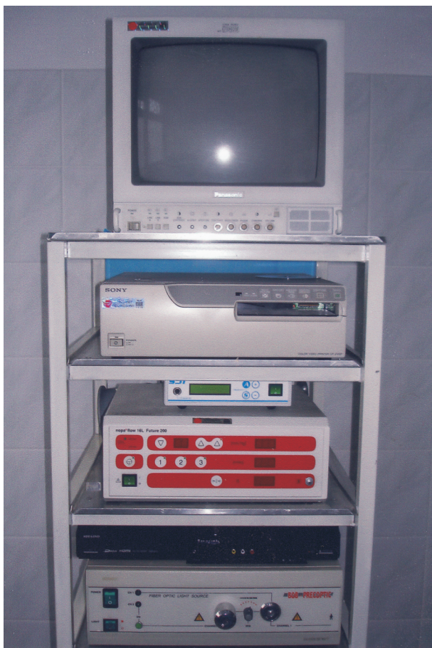
Fig. 1. Laparoscopic unit. From top to bottom: monitor, printer, camera, insufflator, DVD recorder, source of light.