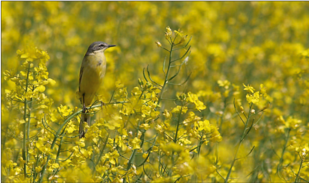
Fig. 1. Yellow wagtail ( Motacilla flava ). This decreasing farmland specialist uses some first generation bioenergy plantation as breeding habitat, but is still declining throughout Europe

fects birds mainly by crops entering previously uncropped or extensively cropped land (set-aside, meadows, abandoned farmland). In Western Europe, most of these types of habitats have already been destroyed by agricultural intensification. In contrast, in Central and Eastern Europe such habitats still thrive on relatively large areas (e.g. abandoned cropland in the Baltic countries and Ukraine, subsistence farming areas in eastern Poland or central Romania). As a consequence, there are greater possibilities for expansion of 2G energy crops in Central and Eastern Europe than in Western Europe [e.g. Kukk et al. (2010) on potential area of 2G energy crops in Estonia]. Such processes could change the farming landscape of Eastern Europe in the same way 1G energy crops did, and put farmland birds in this part of the European continent at significant risk.