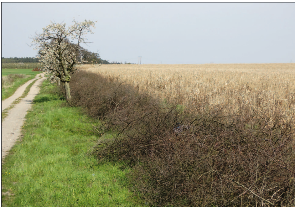
Fig. 4. Destruction of bird-rich roadside shrubs near miscanthus plantation in northern Poland. While bioenergy fields are valuable habitats to some birds, it might be not enough to balance the loss of such structures

Such small-scale structures are rarely included in spatial models that often concentrate on relationships between birds, field crops, grassland and set-aside or fallow land, ignoring smaller structures. However, such structures provide indispensable habitats for farmland birds [e.g. Goławski and Kasprzykowski (2011) for manure heaps], and their importance is quantifiable (Morelli 2014). Their abundance in Central and Eastern Europe might buffer the negative effects of energy crops expansion, provided that they are not destroyed by agricultural intensification (Fig. 5). When modelling bird abundance in eastern parts of the European continent, we strongly encourage