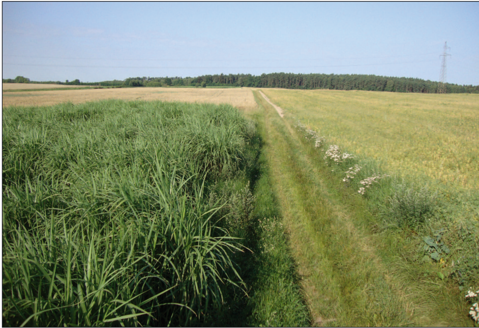
Fig. 3. Miscanthus field in northern Poland. The tall crop might increase heterogeneity of simplified farming landscapes, but its expansion can be detrimental to traditional, high nature value farmland of CE Europe