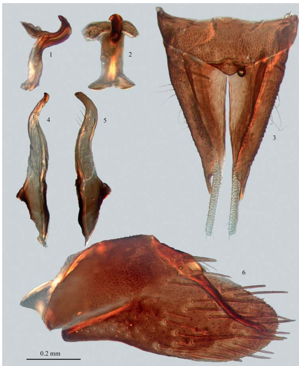
Fig. 3. Apex of male abdomen of Orientus ishidae : aedeagus, lateral view – 1; aedeagus, posterior view – 2; abdominal sternite, genital plates and valves, ventral view – 3; right genital style, lateral view – 4; right genital style, dorsal view – 5; pygofer with process, side view – 6.

10 VII 2014: 1♂, sticky trap for catching grey larch tortrix ( Zeiraphera griseana (Hüb.)) hung in a 100-year old spruce stand, Bruder D. leg., Klejdysz T. det. et coll.;