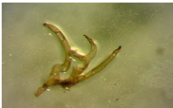
Fig. 2. The leafhopper Macropsis infuscata (upstairs) and its genitalia (downstairs) – natural vector of Russian olive witches'-broom disease in East Azerbaijan province