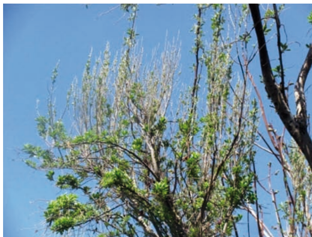
Fig. 1. Symptoms of Russian olive witches'-broom disease in East Azerbaijan province, Iran

Finally, a 1,239 bp fragment amplified in the nested PCR was sequenced and submitted to GenBank as accession number: KJ920334 (' Elaeagnus angustifolia ' witches'-broom phytoplasma). A phylogenetic tree was constructed using partial 16S rRNA sequences of Russian olive witches'-broom phytoplasma and some phytoplasmas in GenBank using Mega5 software.