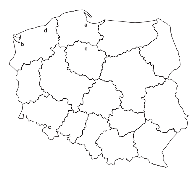
Fig. 1. Localities of soil derivation from oilseed rape plantations infected by P. brassicae

Then the soils samples were placed in pots marked with the letters a, b, c, d, e (Fig. 1). Then selected cultivars were sown in four replications for each locality. Two series of experiments were conducted. The names of cultivars are listed in the tables (Tables 1, 2). At the growth phase BBCH 50-51 (green bud) the evaluation of the degree of infected plants was carried out. To accomplish this, all the plants were dug out, the underground part was washed off and afterwards their infection was assessed. While recording plant disease symptoms a 9-degree scale was used where: 0 - lack of symptoms, 1- small, single tumors on secondary roots, 3 – larger tumors on secondary roots, 5-7 - enlarging tumors on secondary roots and the main root, 9 - a large single tumor on root neck, lack of roots (Robak 1991).