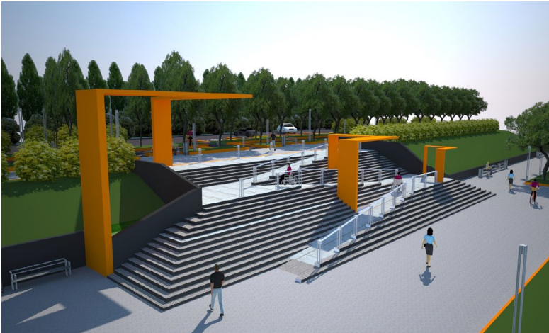
Fig. 1. A ramp – view 1, source: Bogalecki M. A designing exercise in a course in Designing Landscape Architecture Facilities 2, Department of Green Space and Landscape Architecture, Poznań University of Life Sciences, 2013.

The examples of ramps and accompanying elements show design solutions with more dynamic forms and colours. In these cases the ramps and other elements of development are treated both as utilitarian and artistic forms, which should enrich, vary and diversify both urban landscape and green space. Figures 1, 2 and 3 show the views and projection of the suggested spatial and colour solutions for the ramp and stairs.