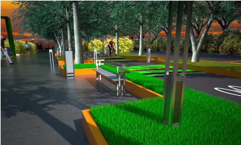
Fig. 4. A view of a bay with a seat. A designing exercise in a course in Designing Landscape Architecture Facilities 2, Department of Green Space and Landscape Architecture, Poznań University of Life Sciences, 2013.

Widok na zatoczkę przy siedzisku.