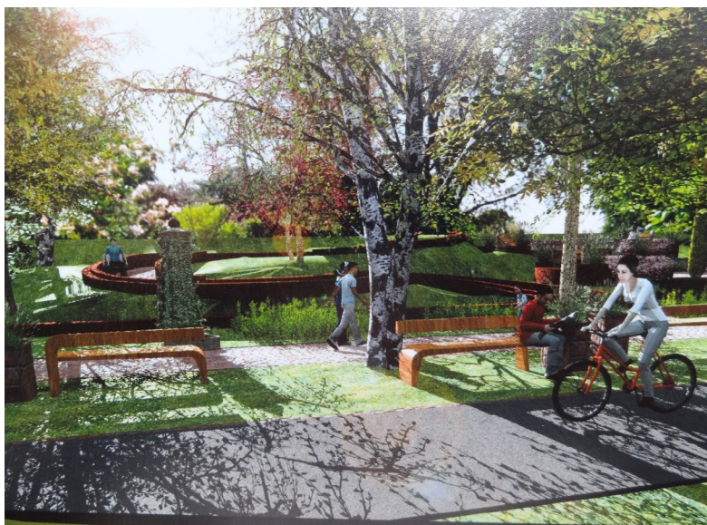
Fig. 9. View from the passer-by on ramps build using liquid line.

Widok na pochylnię zakomponowaną za pomocą linii płynnych, widziany przez przechodnia.