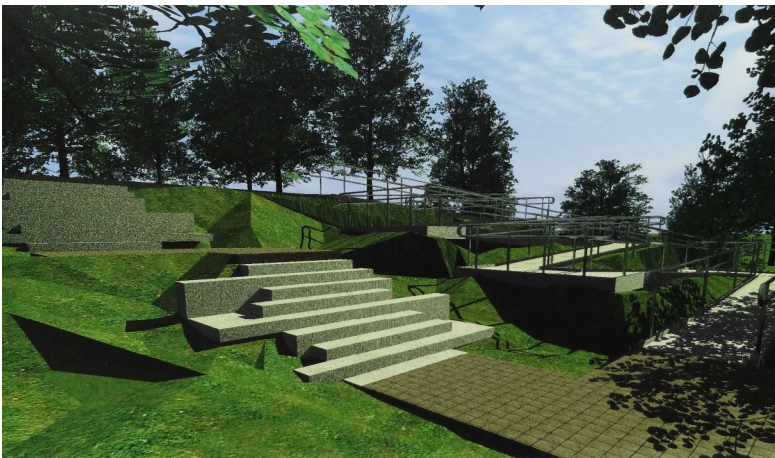
Fig. 7. A view of the ramp and stairs with diverse forms.

Widok pochylni przy różnicy wysokości terenu wynoszącej ok. 7 m.