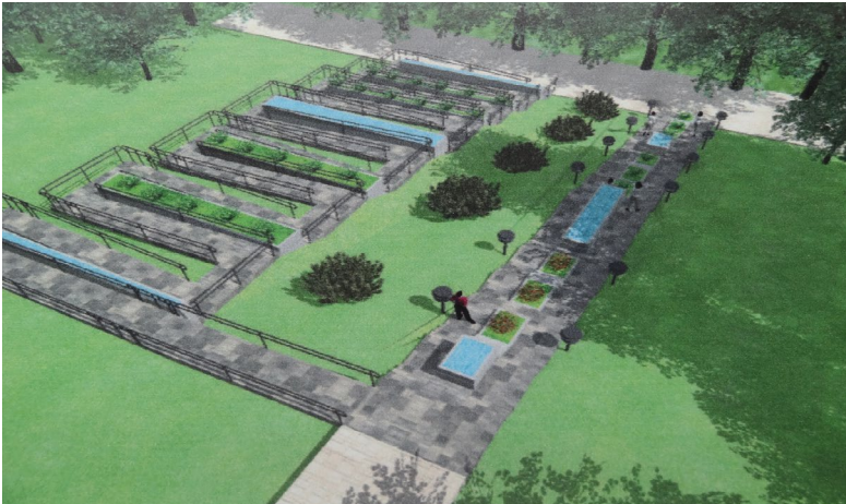
Fig. 6. A view of the ramp with an altitude difference of about 7 m.

Widok pochylni przy różnicy wysokości terenu wynoszącej ok. 7 m.