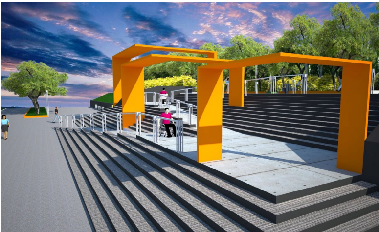
Fig. 2. A ramp – view 2, source: Bogalecki M. A designing exercise in a course in Designing Landscape Architecture Facilities 2, Department of Green Space and Landscape Architecture, Poznań University of Life Sciences, 2013.

Pochylnia – widok 1, źródło: Bogalecki M. Ćwiczenie projektowe z przedmiotu Projektowanie Obiektów Architektury Krajobrazu 2, KTZiAK UP Poznań, 2013.