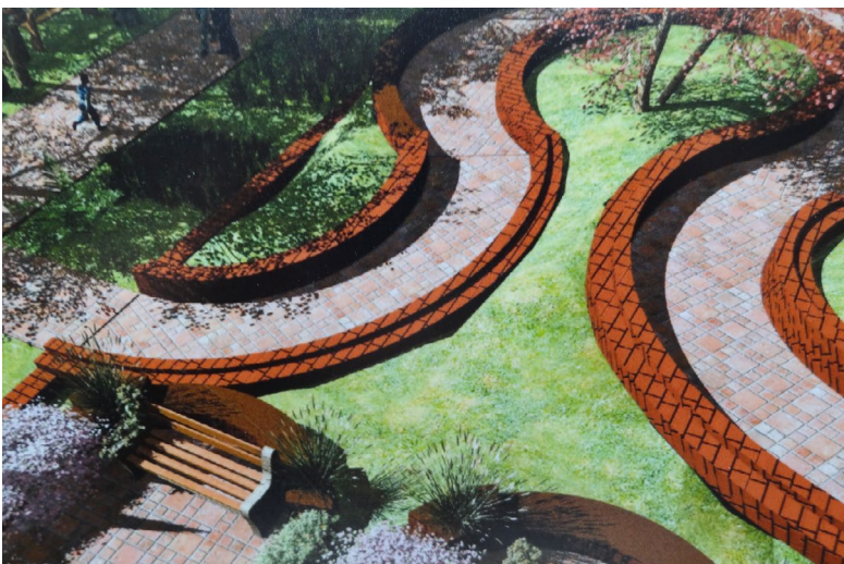
Fig. 8. A top view of the ramp with smooth lines.

In order to match and inscribe ramp elements in the existing surroundings there are suggested solutions which make the rigid geometry of ramp projection and forms milder. This effect can be achieved by means of smoother lines, which better match the natural landscape, as can be seen in the designs in Figures 7, 8 and 9. The use of elements enriching and breaking the monotony of ramp forms is another designing procedure, whose aim is to match the ramp with its surroundings.