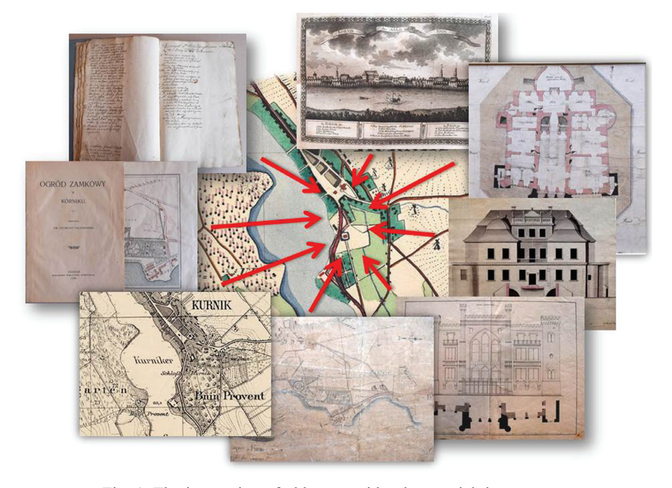
Fig. 1. The integration of old maps with other spatial data sources