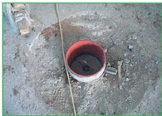
Fig. 1. Incorrect pit