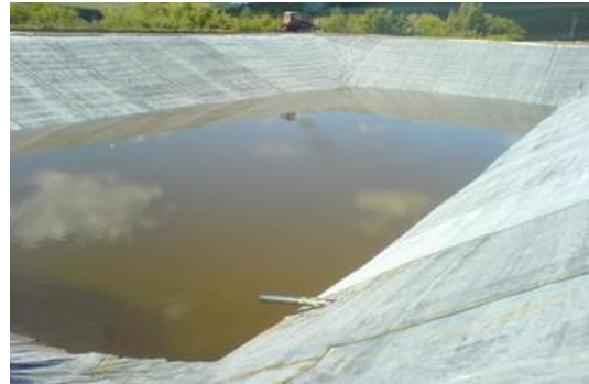
Fig. 5. Manure storage PVC film

In countries with weak economies, it is observed that the cheapest option is the buried or insulated film open manure storage. Manure storage are made from PVC film called "film" or often referred to as "lagoons" (Fig. 5). On the farm should be at least two manure storage lagoons that provide a consistent accumulation of 6-month aging (disinfection) and unloading for the spring-autumn application fields of the annual volume of manure.