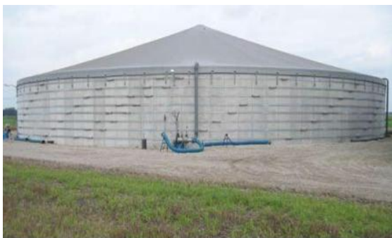
Fig. 4. Stainless steel manure pit

Manure pit sizes are made to ensure the effective application of mixing technology: The diameter should be between 4 to 25 m and the height of walls up to 7 meters. The height of the vertical wall above the ground level usually is set no lower than 180 to 190 cm.