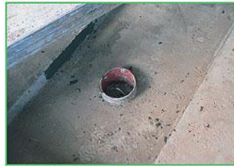
Fig. 2. Correct pit with a gradient of step

It is important not only to observe the correct geometry baths during construction but also follow them through since it has, for instance, been majorly observed that most bath operational staff often does not comply with the instructions of technologists and does not fill the tub for 10 to 15 cm of water. This leads to the fact that the first manure that falls to the bottom of the baths dries up, emits gases, and the descent of the bath is not removed, even if the geometry of the baths are flawless. If the level of water in the bathroom is below the norm (for example 5 cm), the manure will not be covered by the water and the top layer becomed dry, thus resulting to all of the above-mentioned problem.