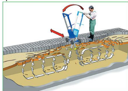
Fig. 3. Mixers for mixing the manure in baths

After the descent of pus from the bath, it passes through the collector pipes to the sewage pump station (SPS) or to the plant division. In this case, a pipe diameter between 250 to 350 mm must be used depending on the filling because pipes of smaller diameter silt, leads to incomplete removal of manure from the baths.