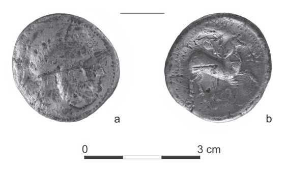
Fig. 2. The coin from Wysoczany; Photo by D Szuwalski; Graphic processing by I. Florkiewicz, P. Kotowicz.