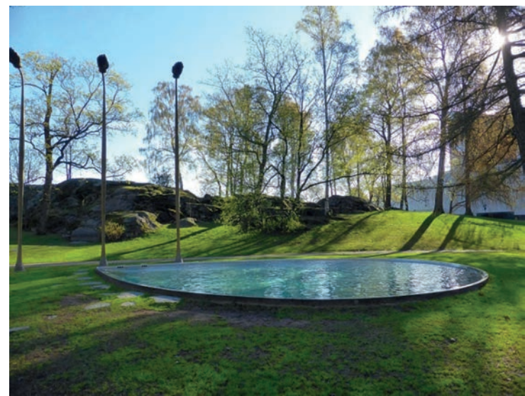
II. 1. Memoriał fińskiego prezydenta Urho Kekkonen, Helsinki, Finlandia, 2000.