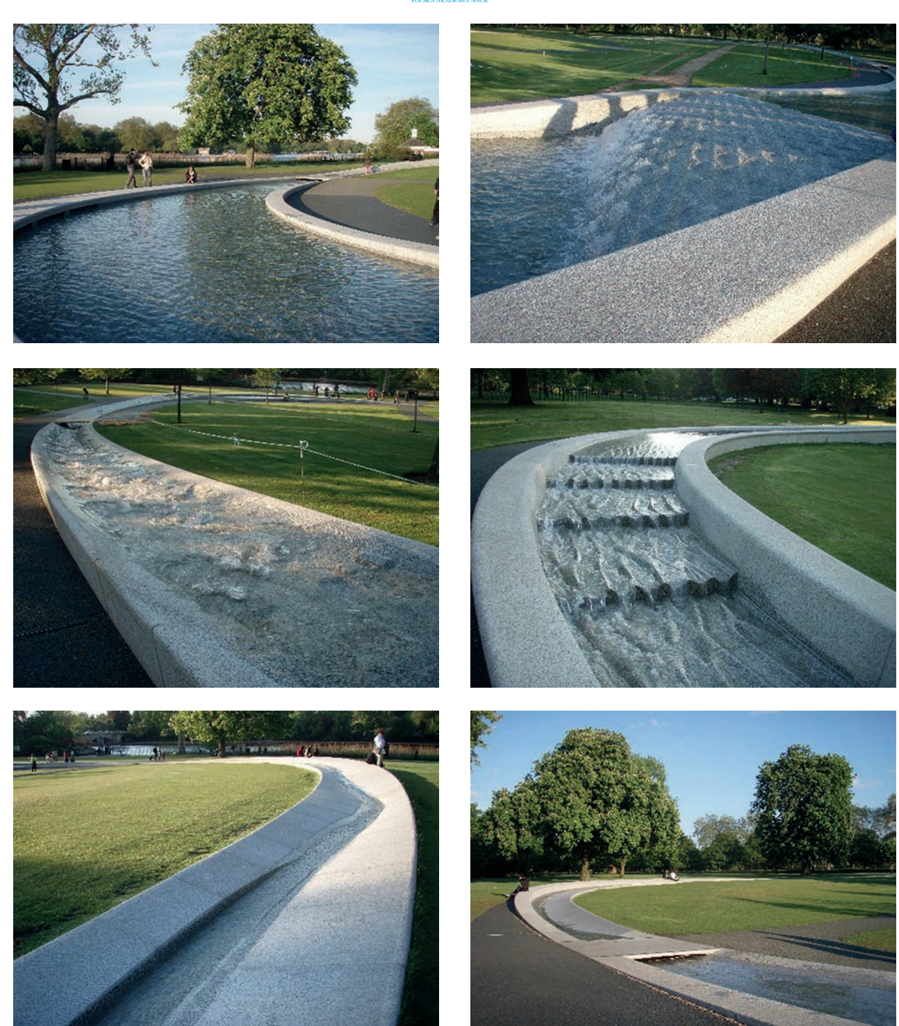
II. 4. Badania dynamiki i statyki wody na przykładzie Memoriału Diany, Księżnej Walii, Londyn, UK, 2003–2004.