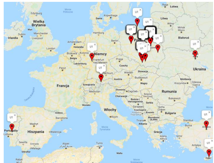
Fig. 2. Top places visited by User A

All locations were predicted based on IP data. The accuracy of that data allows us to visualize the location with a specific city district. 128 most frequently visited locations were chosen for User A. The Locations were visualized using Google Maps and they may be seen in Fig. 2. Each pin depicts one place that was visited. The map does not show the frequency of visits, but it is possible to derive that information from the database and to generate an appropriate report. No summary of all user locations has been presented in a graphic form, as it is similar to the map presenting the most frequently visited locations. It consists of much larger data set, e.g. for User A it has 1,011 entries identified during the period of the experiment.