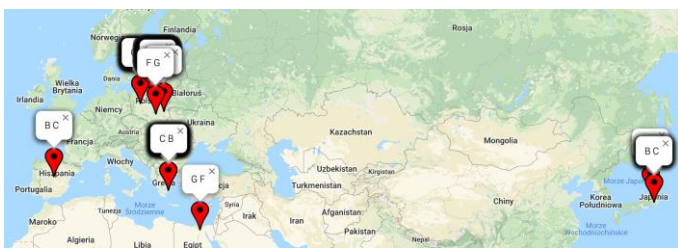
Fig. 3. Physical meetings of the TIMS users

Figure 4 presents the users' meeting locations in Warsaw. The accuracy of the API geolocation service enables us to identify user meeting locations in several city districts. More accurate data can be collected from telecom operators. Therefore, the level of accuracy may be easily increased to specific street names.