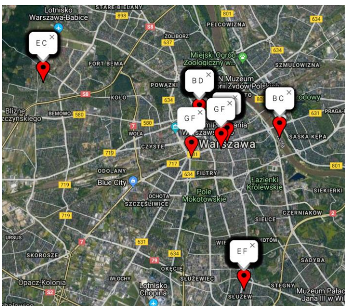
Fig. 4. Physical meetings of TIMS users in Warsaw, Poland

Figure 4 presents the users' meeting locations in Warsaw. The accuracy of the API geolocation service enables us to identify user meeting locations in several city districts. More accurate data can be collected from telecom operators. Therefore, the level of accuracy may be easily increased to specific street names.