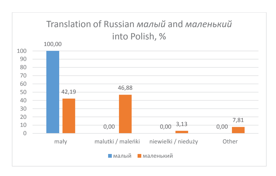
Figure 4. Russian-Polish Translations<sup>6</sup>