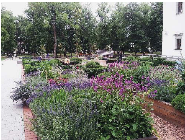
Ill.3. The Garden of the Palace of the Rulers has been restored in the style of a representative residence of the Renaissance.

Il. 2. Plan Pałacu Władców (Dolny Zamek w Wilnie)