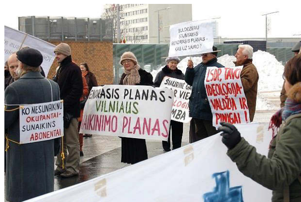
Ill. 5. It is so important to consider the relationship of local territorial communities with the local spirit, giving preference to the needs of people living closer together.

the immediate environment with factors that lead to strong human experiences (ill. 5). Therefore, it is so important to consider the relationship of local territorial communities with the local spirit, giving preference to the arguments of people living closer together, rather than the general view of society as a whole and politicians.