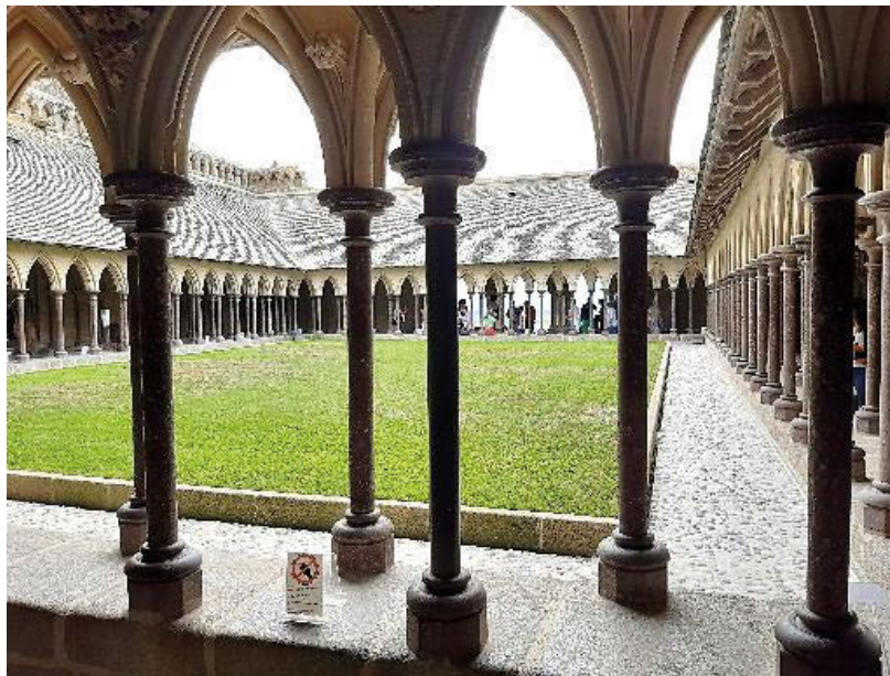
Ill. 1. A garden spaces in Mont Saint Michel (France) monastery.