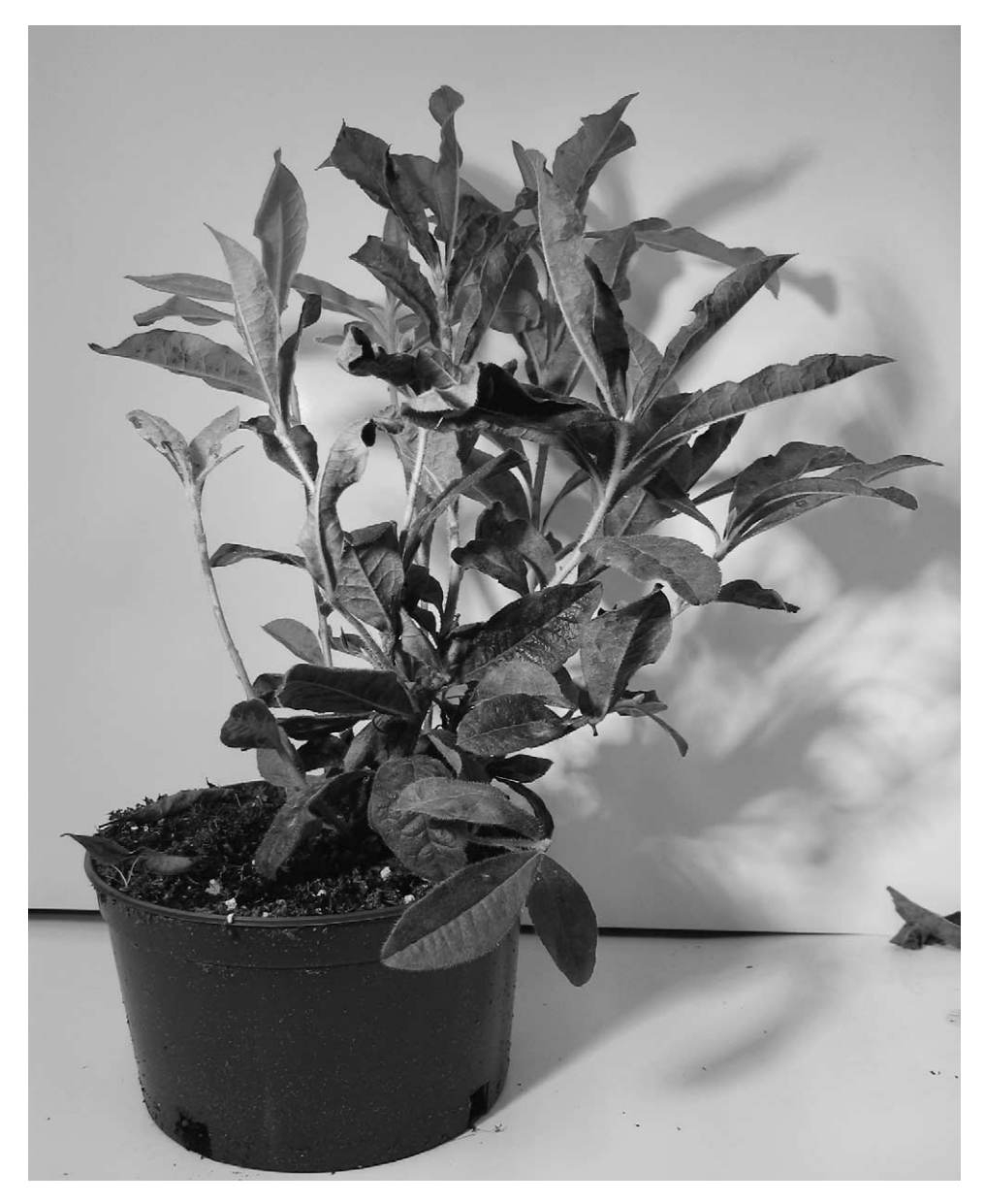
Fig. 2. Rhododendron sp. with disease symptoms

In inoculation test were used 2 isolates obtained from Erica plants and one from used peat. Eight weeks after inoculation first symptoms were observed. P. sydowia-na was recognised as casual disease agent.