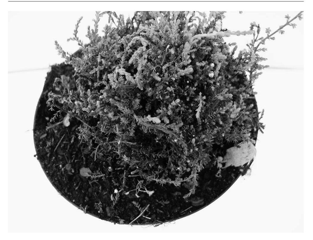
Fig. 1. Erica sp. with disease symptoms