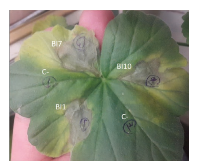
Fig. 2. Hypersensitive reaction (HR) on geranium ( Pelargonium × hortorum ) observed 24 h after inoculation of Brenneria salicis isolates (BI1, BI7 and BI10); (C-) – negative control (distilled water inoculation)

*the author's data; **data from Sakamoto et al. 1999, and Denman et al. 2012