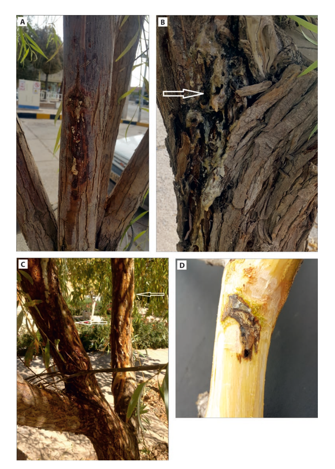
Fig. 1. Symptoms of watermark disease on white willow ( Salix alba ) caused by Brenneria salicis in Iran: A – bark canker symptoms with dried ooze on the stem under natural conditions; B – typical wounds on the trunk; C – brownish and sticky liquid ooze from wounds in the bark; D – dark lesion observed 2 months after inoculation of a bacterial suspension of isolate BI1 on stem of white willow (1-year-old)

of starch, gelatin and arbutin, utilization of cellobiose and tartrate, acid production from sucrose, glucose and mannitol, corresponded well with B. salicis , except tests for D-galactose and D-lactose (Sakamoto et al. 1999; Denman et al. 2012). The phenotypic and biochemical characteristics of our willow isolates, and reference strains of B. salicis that were pathogenic to