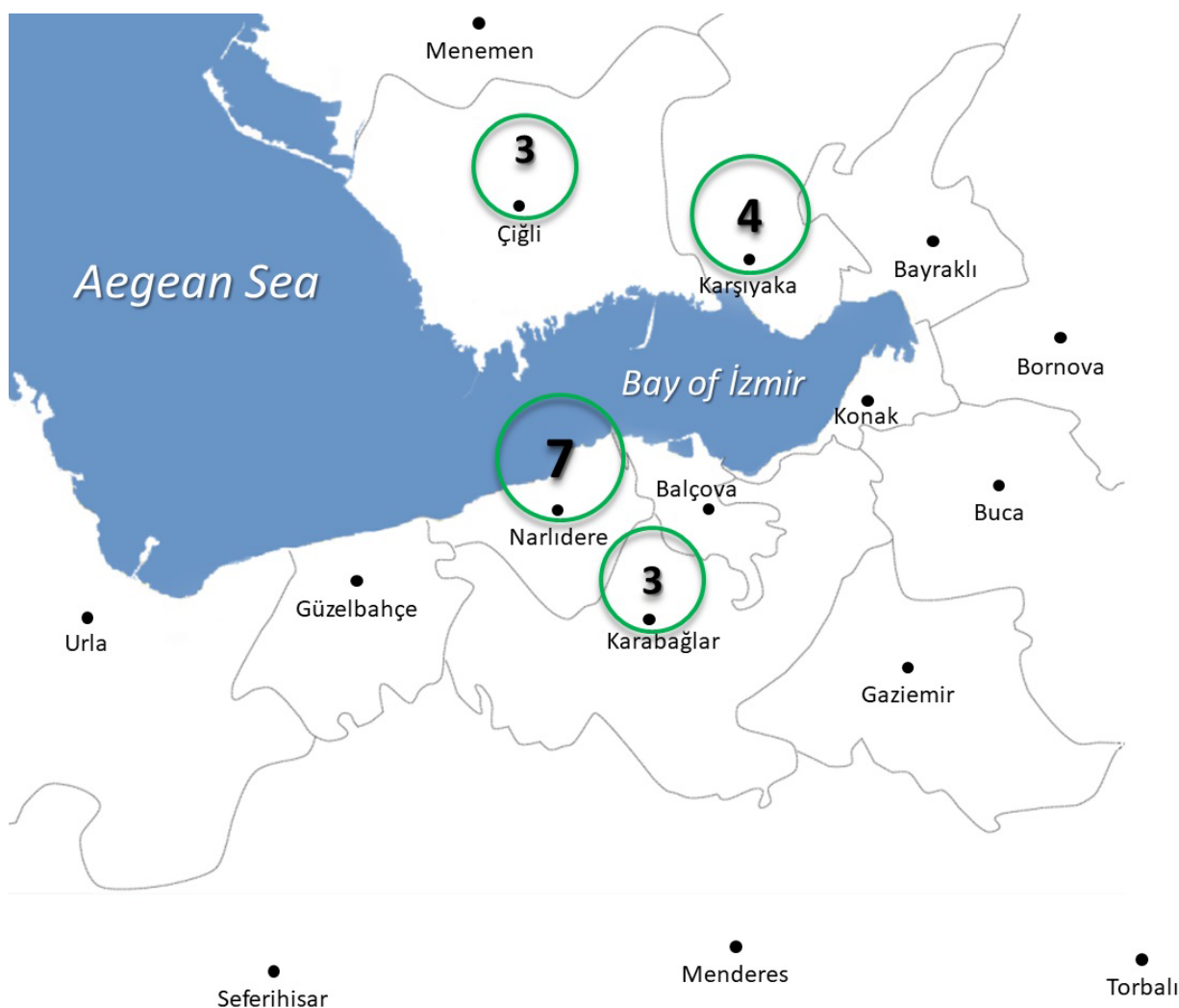
Fig. 1. Distribution of Blastocystis sp. positive cats in İzmir.

tilled water. The amplification reaction was performed as follows: 1 min initial denaturation step at 94°C, followed by 35 cycles of 1 min at 94°C, 1 min at 59°C, and 1 min at 68°C with a final extension for 5 min at 68°C. PCR products were separated using 1% agarose gel electrophoresis and visualized.