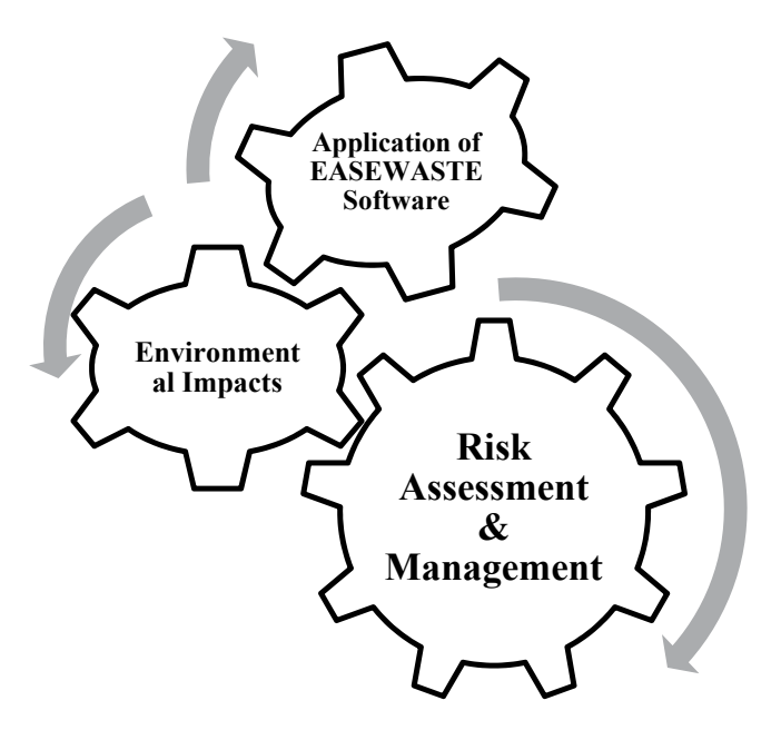
Fig. 1. Impacts assessed from EASEWASTE leads to Risk Assessment

System Boundaries: In this study, boundaries only considered open dumping. Waste dumping site was closed so it is a post assessment of an area (Figure 3). The model has various modules and sub-models, each representing a process in a specific WMS, and these modules can be combined in a scenario to represent a total WMS. Waste generation,