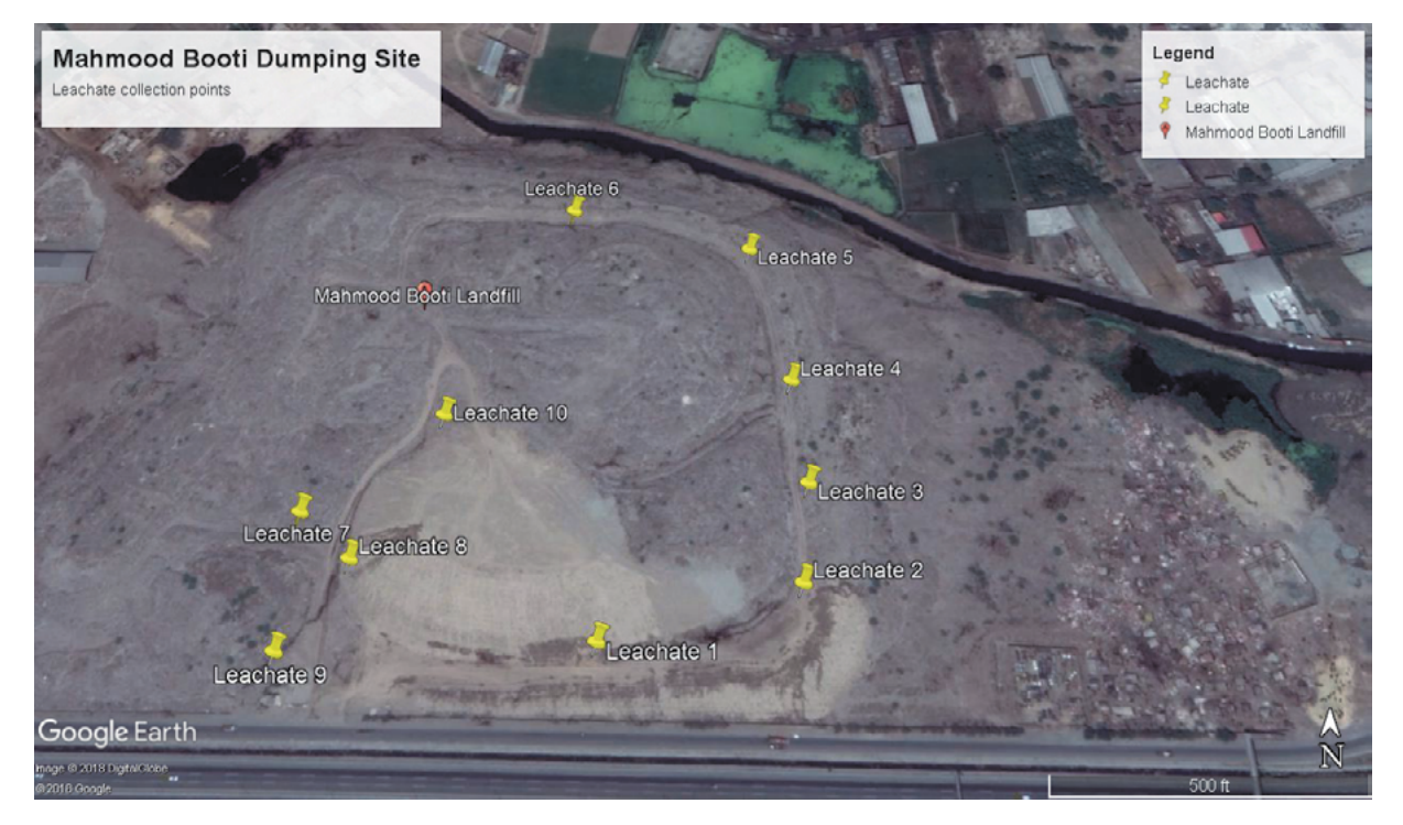
Fig. 4. Leachate sampling points from selected dumping site