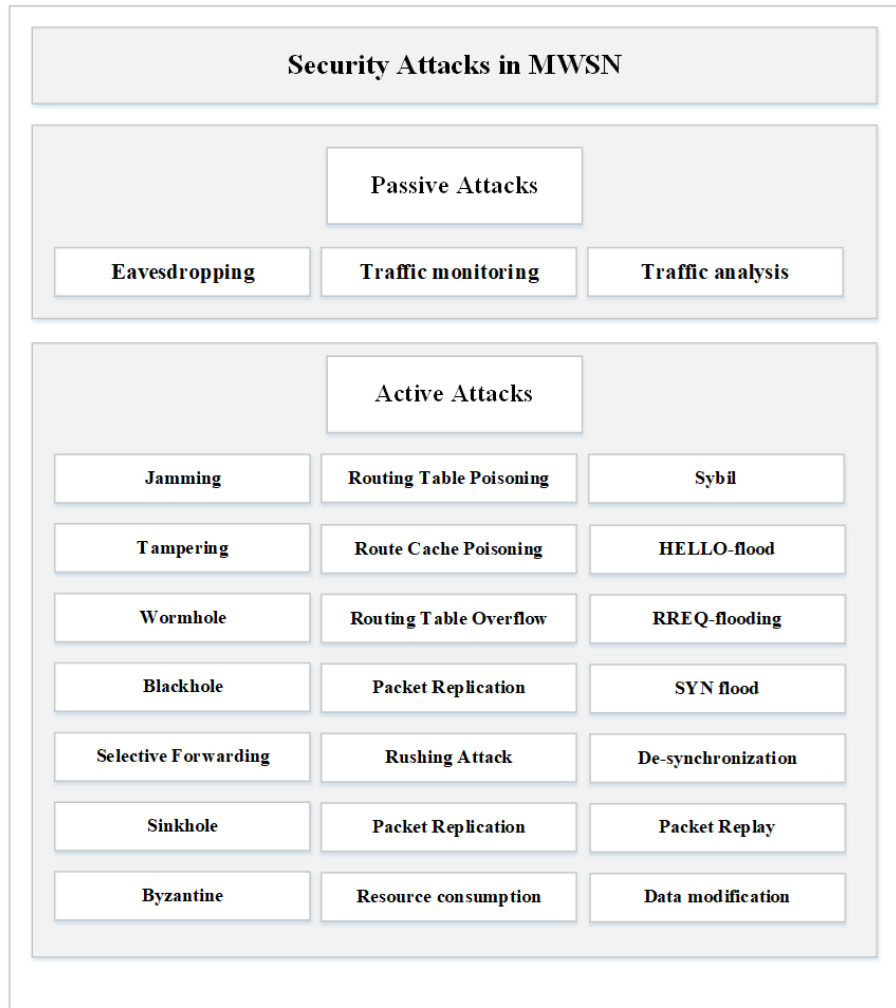
Fig. 2. Classifications of security attacks.