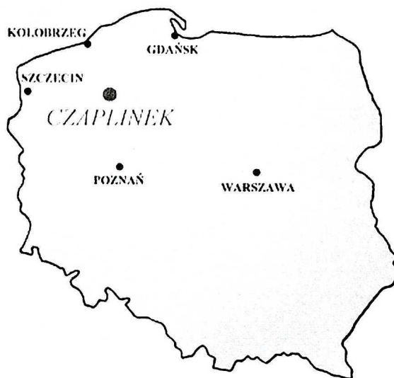
Fig. 1. Location of the research area

Czaplonek is situated in the Drawskie Lake District (Pojezierze Drawskie), north-western Poland (symbol 314.45) which is a part of the Zachodniopomorskie Lake District (Zachodniopomorskie Pojezierze) macro region (symbol 314.4) [11].