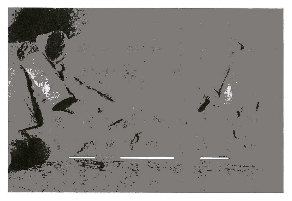
Fig. 2 – disordered body position in grave no. 114