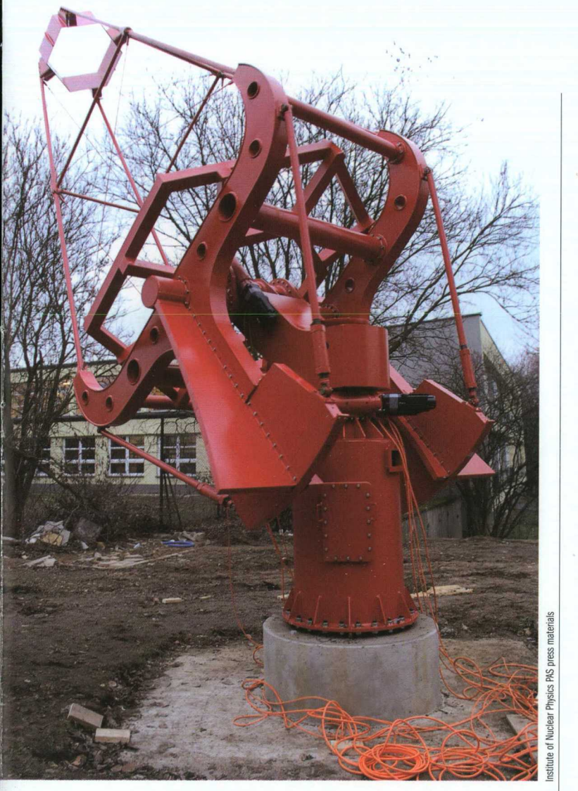
Prototype of the mechanical structure for the small CTA telescope

300 TeV, three types of telescopes will be built: small (with 4-meter dishes), medium-sized (12m), and large (23m).