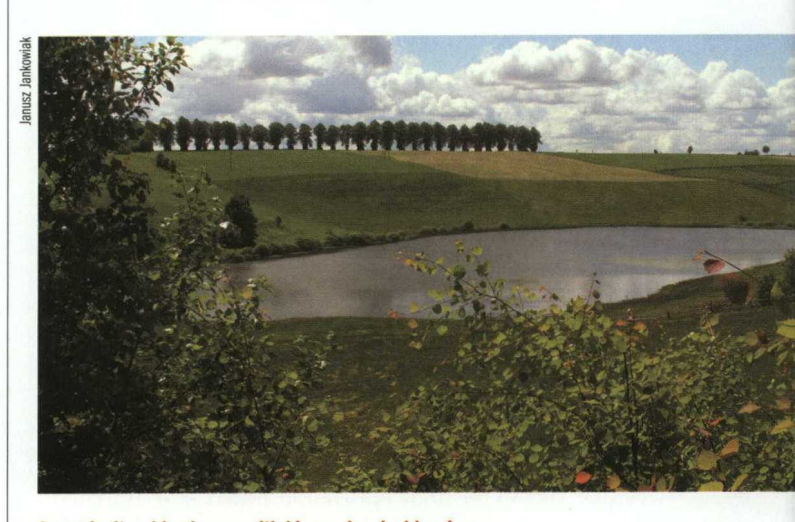
An agricultural landscape with biogeochemical barriers - a strip of shelterbelt and a small in-field water reservoir

Within the plant production process, two systems of mechanical land working are distinguished: the till (traditional)