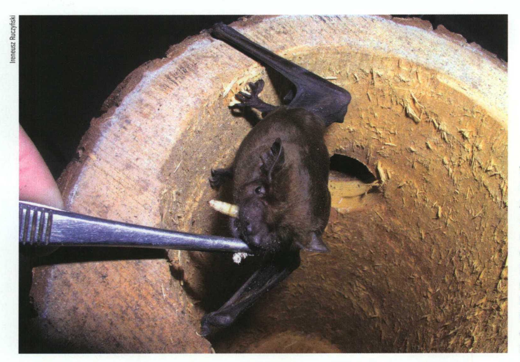
The Mammal Research Institute of the Polish Academy of Science in Białowieża has carried out research on bats' strategy of finding new hideouts. Finding a tree hollow using just echolocation is difficult. Once a hollow has been identified, other bats can be informed of its existence