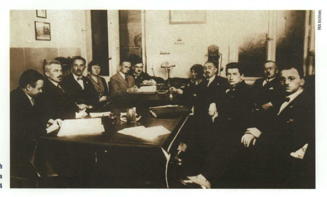
Association of Polish Teachers of Public Schools - Board of Directors, 1924

Polish society had been plagued with unemployment, food shortages, and queues for a few years already, and nearly all of commerce was dominated by black market mechanisms. In 1918 the price of a stick of butter was the same as an intellectual's daily salary, while the earnings of a tenement building janitor exceeded those of a university professor. The early 1920s were characterized not only by ubiquitous high prices, but also by galloping inflation and paper/printing costs that increased on a daily basis. Publishing journals, buying books, and engaging in social life were becoming increasingly difficult. In 1917 the real value of white-collar workers' salaries was just 17.9% of those from before 1914, and the difference between the earnings of whitecollar and blue-collar workers decreased dramatically. An engineer's pay had been 617%