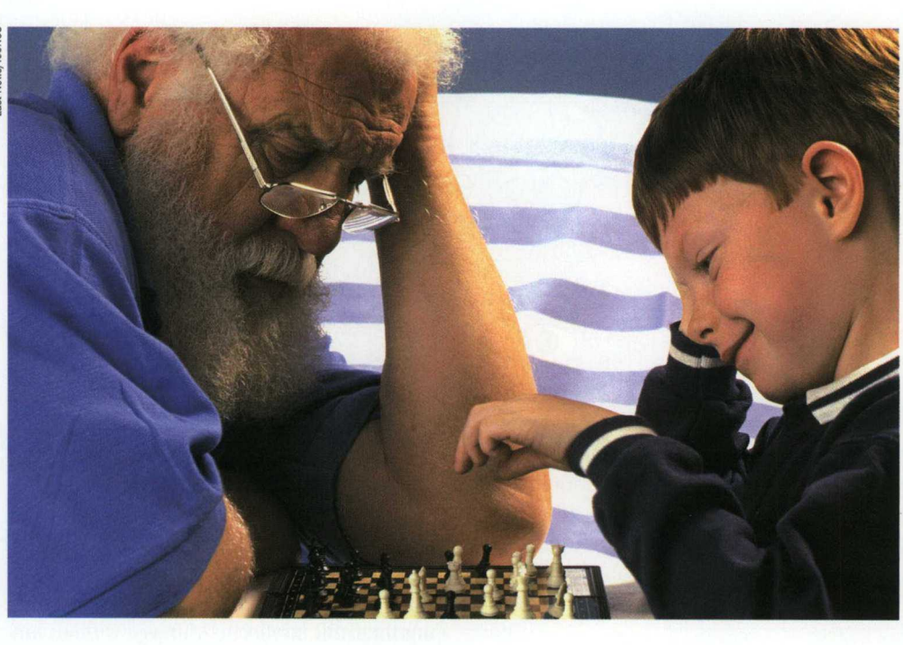
Grandfather and grandsom playing a game of chess: whose memory will prove more fallible? Scientists argue that the aging process, in and of itself, does not in fact lead to significant memory lapses

the synthesis of cholinergic and glutaminergic receptors (information transmitters), involved in the mechanisms of learning and memory, as the brain ages. These findings indicate that the age-related impairment of memory (in contrast to Alzheimer's) is caused by disorders of the information transmission process in the nerve endings, not by the death of neurons.