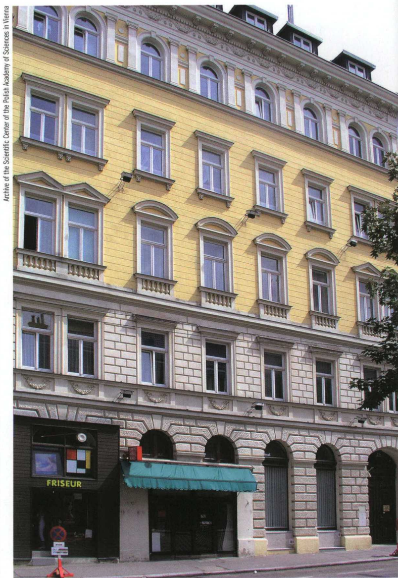
Archive of the Scientific Center of the Polish Academy of Sciences in Vienna

The Vienna Scientific Center works together with the institutions of the Austrian Academy of Science, fostering closer collaboration between the Polish Academy of Sciences and its Austrian counterpart. An excellent