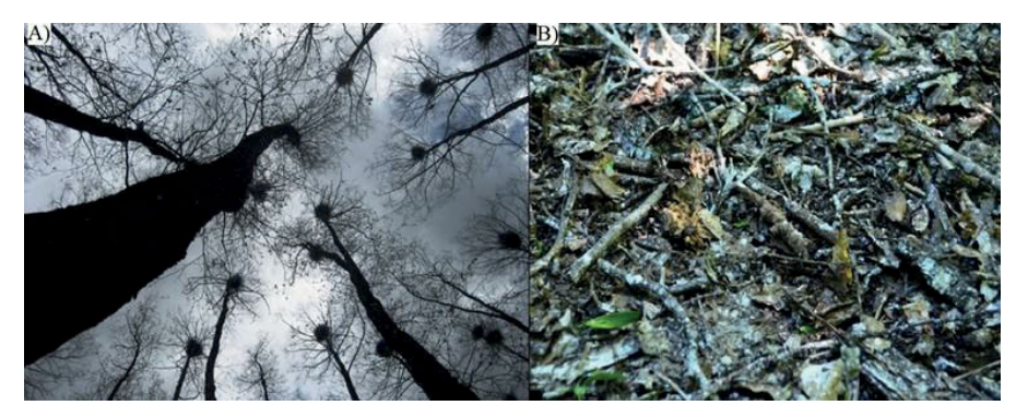
Photo 1. A part view of great cormorant breeding colony: A) nests in tree crowns, B) visible traces of bird activity on the ground

The analysed parameters of nematode communities were density (total and for trophic groups) and percentages of the different trophic groups. Two nematode functional indices were also calculated: the enrichment index ( EI ) and the channel index ( CI ) (Ferris, Bongers and Goede de, 2001). As these indices integrate the responses of nematode taxa from different trophic