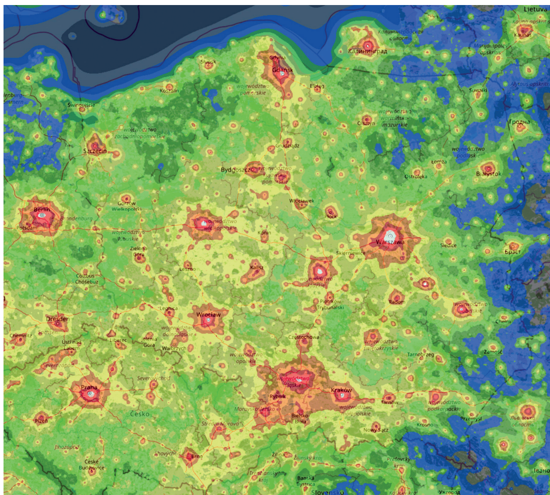
Map of light pollution in Poland in 2020 (according to World Atlas of the Artificial Night Sky Brightness, https://djllorenz.github.io/astronomy/lp2020/overlay/dark.html )

However, the rapid growth in the global human population, swift urbanization, armed conflicts, the expansion and greater density of sea and land transportation routes all contribute to increased global noise pollution. Nowadays, various organisms are finding it increasingly difficult to live in a world saturated with artificial sounds generated by human activity.