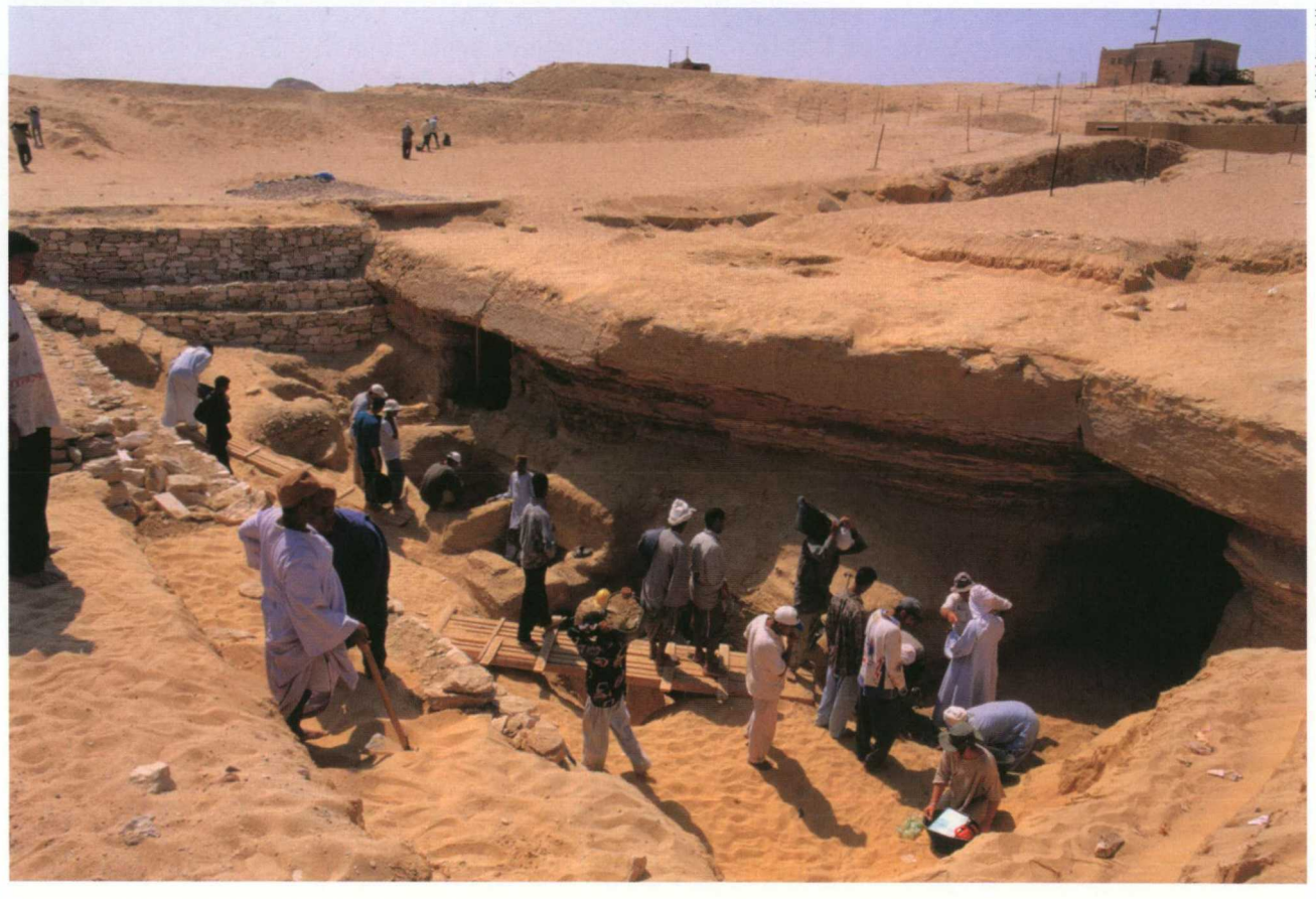
Discovering the huge "dry moat" hewed in the rock beside the world's oldest pyramid in Saqqara

Of course, the methods of archeology have developed greatly over the past 20 years, and the technical sciences, above all geophysics, are being employed to a greater and greater extent. No excavations in the Nile Delta, or essentially anywhere in Egypt, now start without what is called "geophysical prospection," investigating the electromagnetic resistance of what lies hidden inside