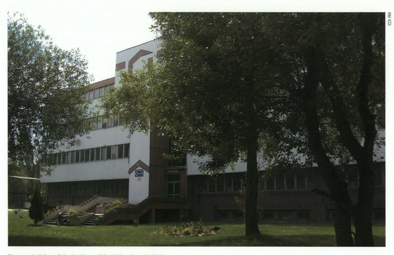
The new building of the Institute of Coal Chemistry in Gliwice