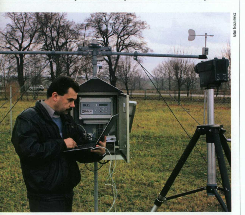
Measurements taken using an automatic agro-climatic station, a thermal vision camera, and a Time Domain Reflectometry device for identifying the moisture and salinity of soil. Our Institute has been selling such devices in 20 countries for many years. Radio communications make it possible to create measurement networks as well as links to airborne and satellite observation systems

Agrophysics is a relatively new discipline that applies physical research methods and data analysis to various agricultural materials, products and processes that occur in ecosystems. Particular attention is given to sustainable plant and animal production, modern agricultural technologies, and the quality of raw materials and food products. Agrophysics covers all the physical and physicochemical interactions between soil, plant and atmosphere; the processes and parameters of harvesting, trans-