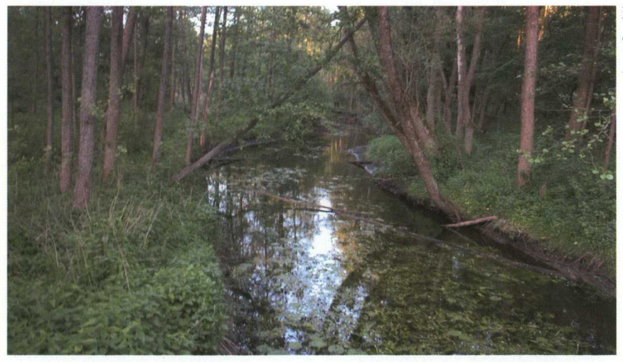
Poland has preserved many natural areas of precious value, such as the unique Biebrza Marshes or the Białowieża Forest (shown above). They can serve as excellent targets for interdisciplinary research by international groups of scientists

iting scientists from all over the world, I can say that in my opinion one of the world's most efficient organized research institution is Germany's Max Planck Society. This is the result of both the pragmatism whereby it functions and its very good financial condition, stemming in part from public funding to support research at Max Planck institutes. The key to its success, however, lies in dynamic management: the Max Planck Society authorities can, in justified cases, very quickly replace the directors of research units or change research priorities. That would be much more difficult in Poland. The existing regulations do not give the Academy's authorities such power - at least at present. Despite these limitations, however, we have already initiated a firm basis in our Academy