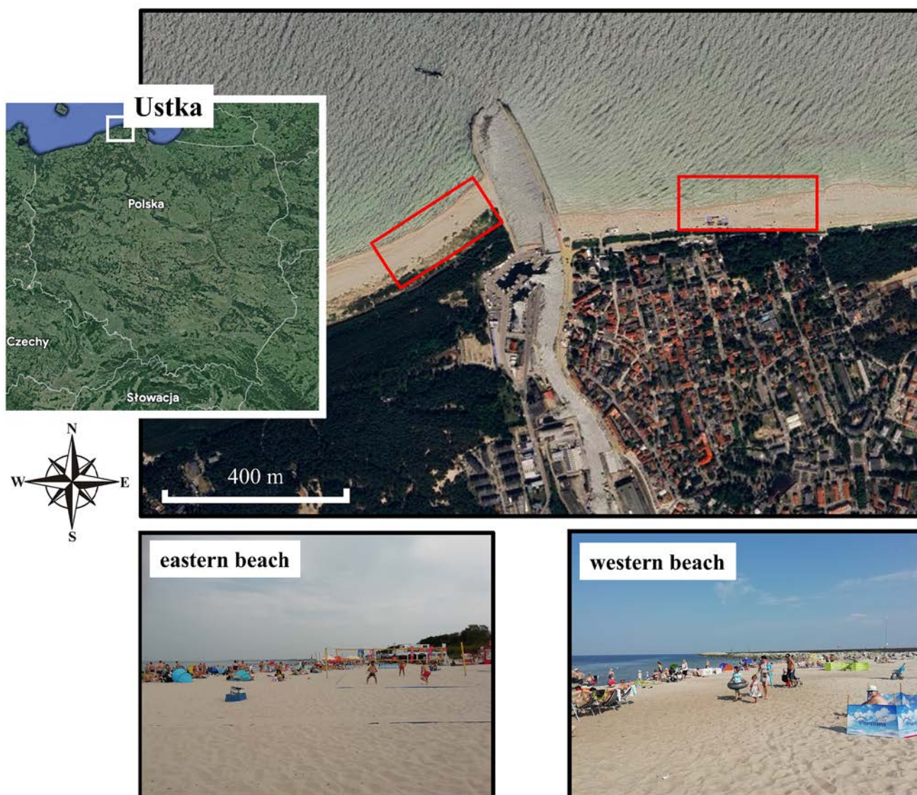
Fig. 2. Location of research site.

results were graded. For statistical reasons, as well as for convenience, the coefficient K (20 involved in the equation), was inserted into the equation. The beach classification of the applied methodology is shown in Table 2.