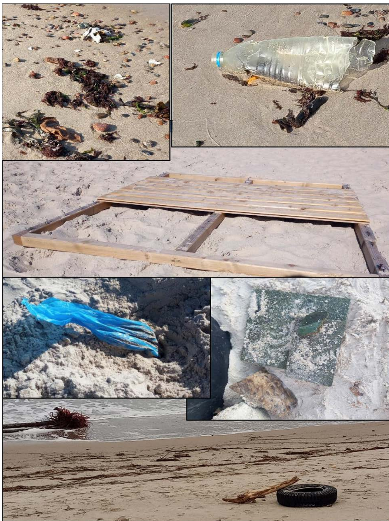
Fig. 1. Examples of garbage found on the beach in Ustka.

2015; Zhang et al. , 2017; Bhuyan et al. , 2021; Liu et al. , 2022). In the past, studies focused on distribution of heavy metals, organic matter and pollution status of coastal sedi-