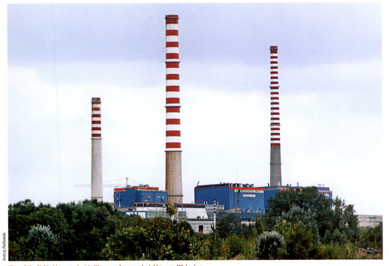
View of the Siekierki power plant in Warszawa from nearby bridge over Wisła river

Lead accumulates in tissues and is dangerous even in small doses. Nevertheless, a large dose is required before