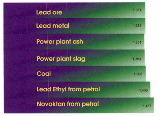
Percentage of <sup>204</sup>Pb in lead from various sources. Differences are minute, but can be identified with proper research methods

We measured the isotopic composition of lead with thermal ionization mass spectrometry (TIMS) at our laboratory. First we analyzed the coal from the Halemba and