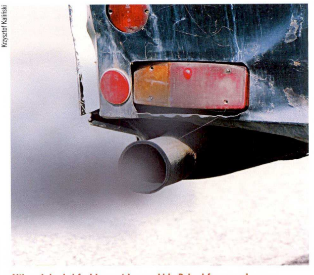
Although leaded fuel has not been sold in Poland for several years, substantial amounts of lead from petrol are still present in soils

the slag and ash from Siekierki. Then soil samples were taken from a depth of 20 cm in various areas within a few kilometers of the power plant. The measurements showed that samples from locations nearest to the power station and from a site 2.5 km to the north had lead isotopic composition identical to the ash, slag and coal. But 4 km east of the plant the composition was already quite different and virtually indistinguishable from natural (mineral) lead composition, implying no influence of the plant in this area. Generally, the spatial distribution of lead from Siekierki can be attributed to the influence of southerly and south-westerly winds – an interesting find, knowing that the prevailing winds in Warszawa area are westerly. This is possibly due to the fact that warmer winds from the south mobilize the ash to a greater degree.