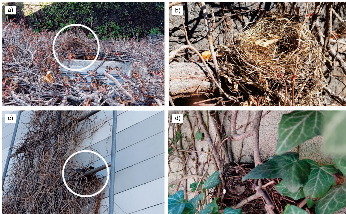
Photo 3. Examples of the nests of: a) Eurasian collared dove on the wall covered with Boston ivy, b) Eurasian blackbird on an old branch of Boston ivy, c) wood pigeon among Virginia creeper, d) Eurasian blackbird among mature English ivy

The highest density and number of nests were observed on the western and southern walls of the Tadeusz Kościuszko Electrical School Complex (Photo 4). Based on interviews with residents and staff members, as well as the trunk thickness and plant range, it was inferred that this Boston ivy was planted before, during, or shortly after World War II. It covers walls with a total length of over 50 m and a height of 5 m. Thanks to its dense network of vines, it serves as a breeding site for successive generations of Eurasian blackbirds. Among all the objects included in the study, only two were covered by such ancient Boston ivy, and it was on these walls that the highest number of synanthropic bird nests were found. In other cases, nests were scarce. The observed bird species on the GFs, as well as on the surrounding walls of other buildings, trees, and shrubs, were compiled in Table 3.