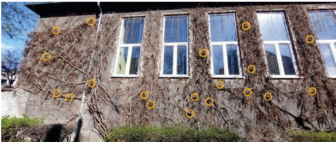
Photo 4. Location of 19 nests (mainly belonging to blackbirds) present on half of the western wall of the gymnasium hall of the Tadeusz Kościuszko Electrical School Complex in Opole, covered by over 70-year-old Boston ivy

The correlation between the known or estimated age of climbers and the number of bird nests was calculated using the Spearman test after checking for non-normal distribution of the data. Obtaining a result of r_s = 0.80683 , with p (2-tailed) < 0.001 , indicates a very strong and statistically significant correlation between the age of climbers and the number of nests. Nests were only present on climbers older than 10 years, and the highest number of nests was observed on the oldest climbers in the city. The study examined the nesting patterns of birds across four types of infrastructure and employed statistical analyses, including the Kruskal–Wallis test and post hoc Tukey’s test. The results revealed significant differences in the number of observed nests among the infrastructure types (Kruskal–Wallis test, p < 0.001 ). Post hoc Tukey’s test indicated that the highest number of nests was observed on GFs, followed by walls with crevices, balconies,