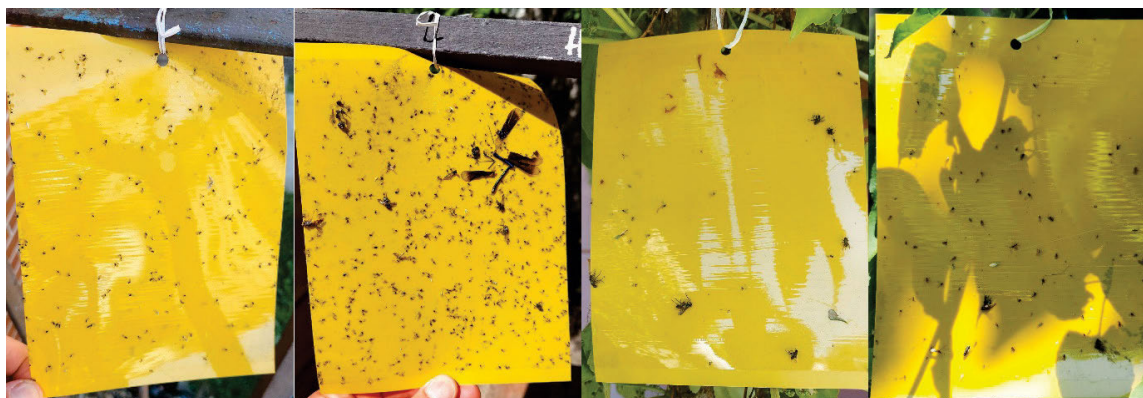
Photo 2. Examples of captured arthropods on the boards hung for a period of 72 hours