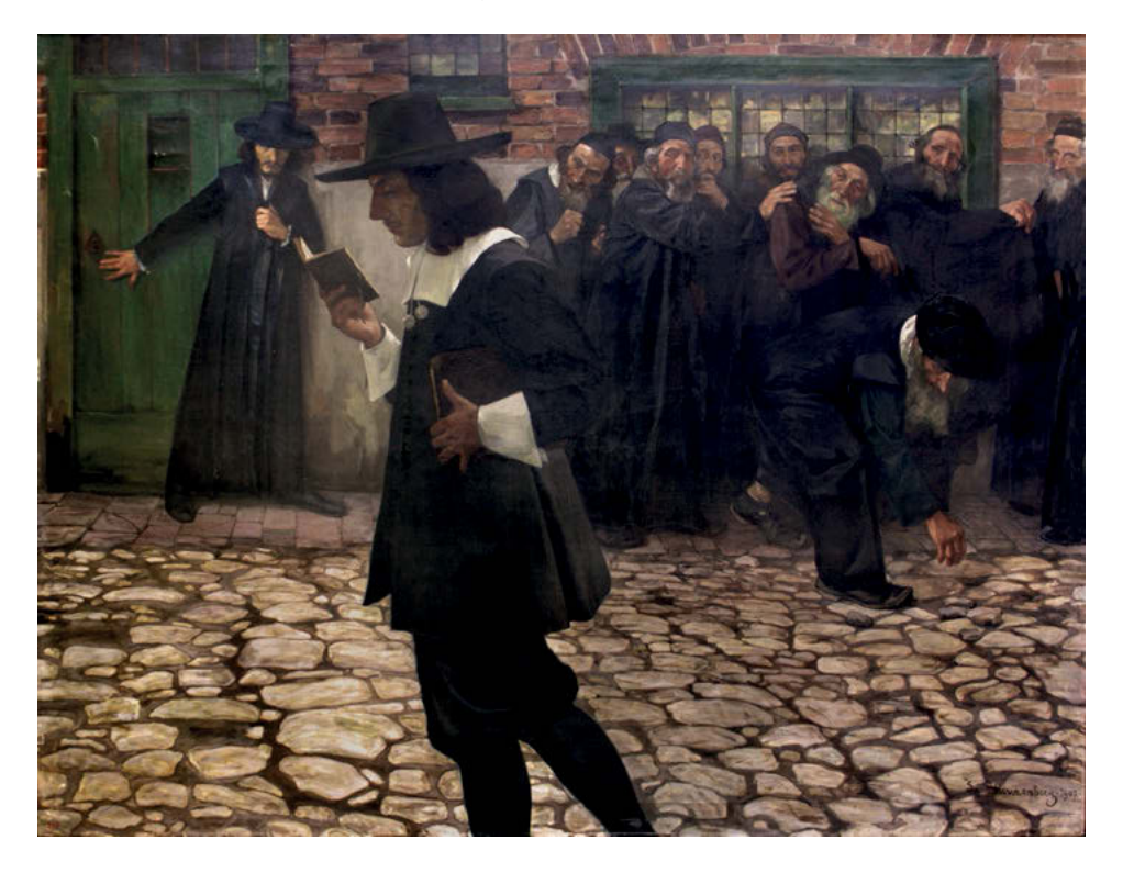
Figure 2. An early modern display of <code>hērěm</code> in effect: <code>Spinoza</code> and the <code>Rabbis</code>, by Samuel Hirszenberg (1907)

Testament and ancient Mesopotamian noted in our discussion of RIÉth 270 bis. <sup>246</sup> That ideas born of this tradition continued to resonate into modern times is most famously <sup>247</sup> evidenced by the ban (Hebrew ½ērěm) placed on the philosopher Baruch Spinoza by the Sephardic rabbinate of Amsterdam in 1656, one clause of which read: 'And may the Lord erase his name from under the heavens.' <sup>248</sup> From this perspective, one can appreciate the seriousness of the crime of defacing or in other ways destroying a royal monument in view of the statement in RIÉth 270 bis/33–34 that the very name of anyone guilty of such a misdemeanour would be cast out from the land of the living.