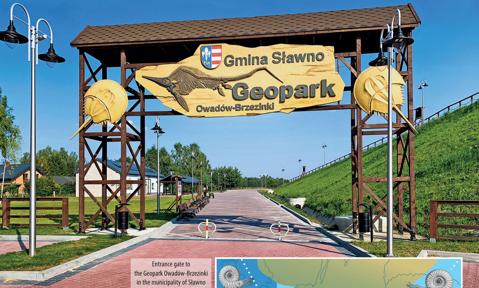
Entrance gate to the Geopark Owadów-Brzezinki in the municipality of Sławno