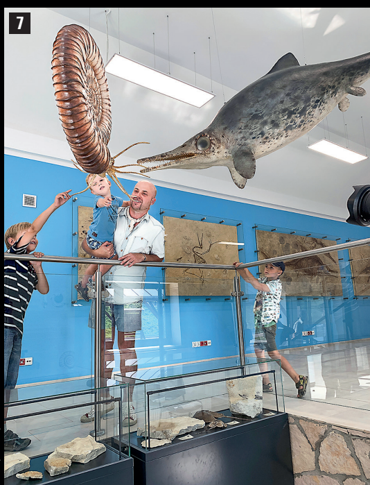
Photo 1 Skeleton of an ichthyosaur Photo 2 Brachiopods Photo 3 Ammonite Virgatopavlovia Photo 4 Lobster-like crustaceans “ Mecochirus ” Photo 5 Carapace of a cryptodire turtle Photo 6 Tooth of a plesiosaur Photo 7 The on-site museum displays life-sized replicas of animals that once roamed the local seas and islands during the late Jurassic period

but also globally. For context, the United States as a whole can boast only a few well-preserved specimens of Jurassic horseshoe crabs, whereas this single Polish site has yielded over 300, all perfectly preserved. Intriguingly, studying the morphology of these fossils has revealed that they all represent juvenile individuals.