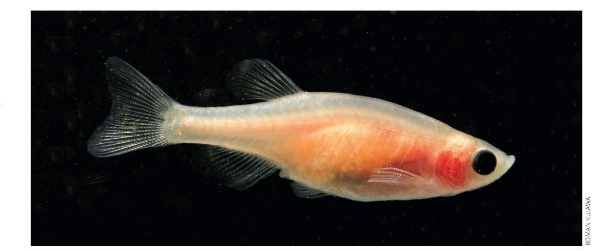
The Casper strain of zebrafish, such as this specimen, remains transparent throughout its life, allowing scientists to peer inside its body

Yet another surprising advantage of zebrafish is how closely their heart's electrophysiology resembles that of humans. The heartrate of mice – a common model for research – is 10 times faster than that of humans, but that of the zebrafish matches the human heartbeat. This makes zebrafish ideal for studying heart rhythm disorders. The transparent bodies of zebrafish larvae and their external development make it possible to observe changes in the heart from the earliest stages of life, which is crucial for researching