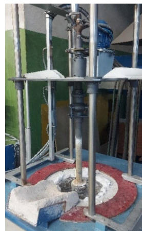
Fig. 1. Experimental stand for implementing powder fluxes in rotary degassing system

The equipment on which the tests were carried out was installed in the Experimental Foundry of the Faculty of Foundry Engineering at AGH University of Science and Technology; this equipment is an integral part of a medium-frequency thyristor induction furnace with a melting capacity of up to 60 kg for aluminium alloys. A view of the station is shown in Figure 1.