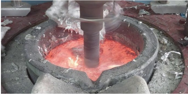
Fig. 5. Effect of introducing powder flux into metal bath – characteristic flare visible on surface of liquid metal

A characteristic effect of the properly conducted powder-flux-insertion process was the occurrence of flares, which could be observed on the surface of the liquid metal – Figure 5.